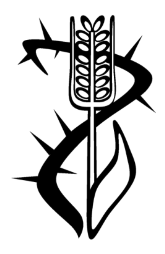
Eighth Sunday after Pentecost July 23, 2023

Mission: To proclaim the gospel of Jesus Christ to all through worship, education, outreach, and fellowship.